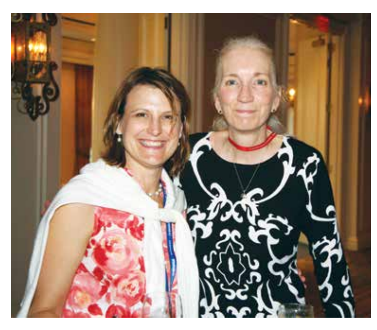
CPHQs celebrate at the annual CPHQ Reception.

The CPHQ program enjoyed another year of upward trends in 2012, gaining approximately 100 new CPHQs while maintaining a robust renewal rate of 72%. Although this rate is slightly lower than 2011, it continues to be higher than the national average. Several programming improvements, including an online recertification application, increased website usability and functionality, and increased communication with certificants, have helped these numbers grow. Persistent focus on a user-friendly process will continue to bode well for the program and increase the credential's value in the years to come.